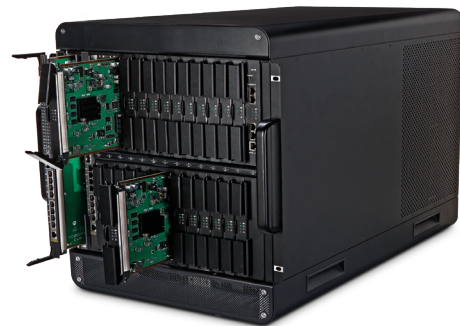
SkyEdge II-c System