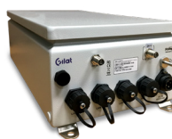
Capricorn Outdoor - All-weather satellite router