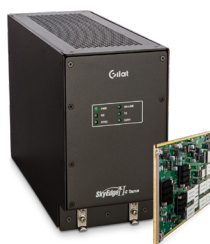
Taurus- Ultra-high-performance aero Modman