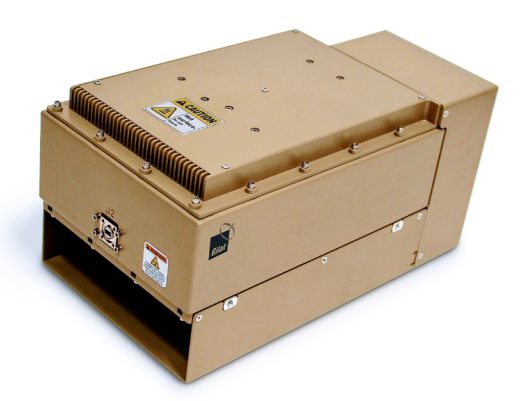
Matchbox 50W Ka-Wideband BUC